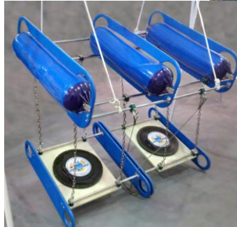
Dual-Source Bubble Gun™ Vehicle