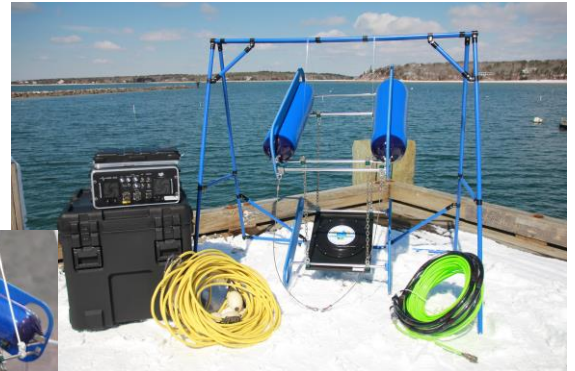
Complete Single-Source Bubble Gun™ System shown with source vehicle suspended on display frame and shipping case for transceiver and cables