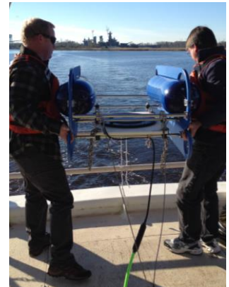
Source vehicle is compact and easy to deploy