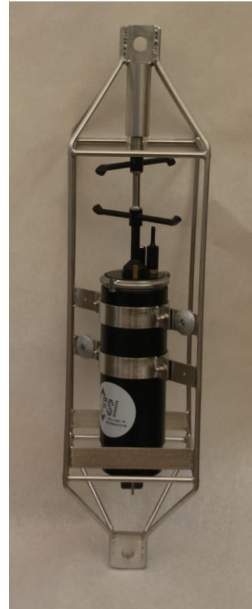
FSI ACM-WAVE-PLUS shown with optional CTD and 5-ton frame

The device may also be equipped with an optional CTD module, and can be configured to log up to two analog inputs from external sensors (e.g., DO, OBS, Fluorometer, Transmissometer).